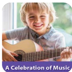
A Celebration of Music

Throughout Construction , children apply the science, social studies, and math concepts they have learned all year. They use a series of sequential steps and scientific experimentation as they create buildings and communities of their own. Children also practice their language, literacy, and social-emotional skills as they work together to plan, create, and assess community structures. Finally, their fine art and motor skills are put to work as they design structures, plan for their use, decorate, and actually make them function properly!